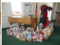
UMW Tea, April in Paris